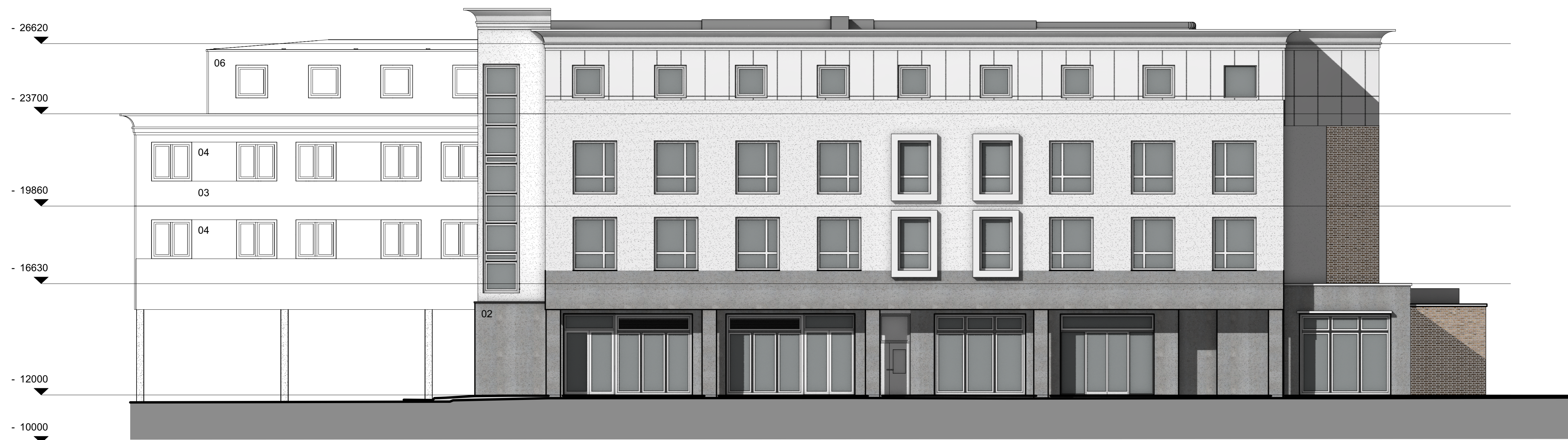
1 SOUTH EAST ELEVATION Scale: 1:100

This drawing is the copyright of Axiom Architects. It is for planning application purposes only and may not be reproduced in whole or in part without permission. Drawings lodged for planning approval may be reproduced by the Planning Authority in accordance with the "Copyright (Material Open to Public Inspection) (Marking of Copies of Plans and Drawings) Order 1980" and must carry the relevant copyright restriction note. Scaling from this drawing should only be carried out from a print at the scale and size specified within the title block. Responsibility for ensuring correct size reproduction remains with the reader.