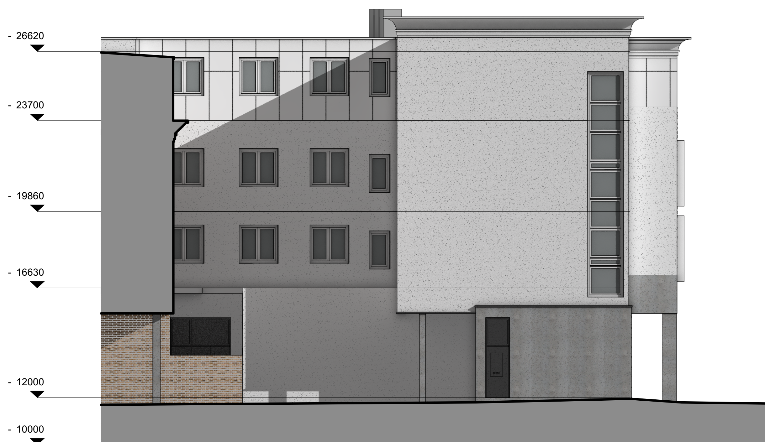
2 SOUTH WEST ELEVATION Scale: 1:100