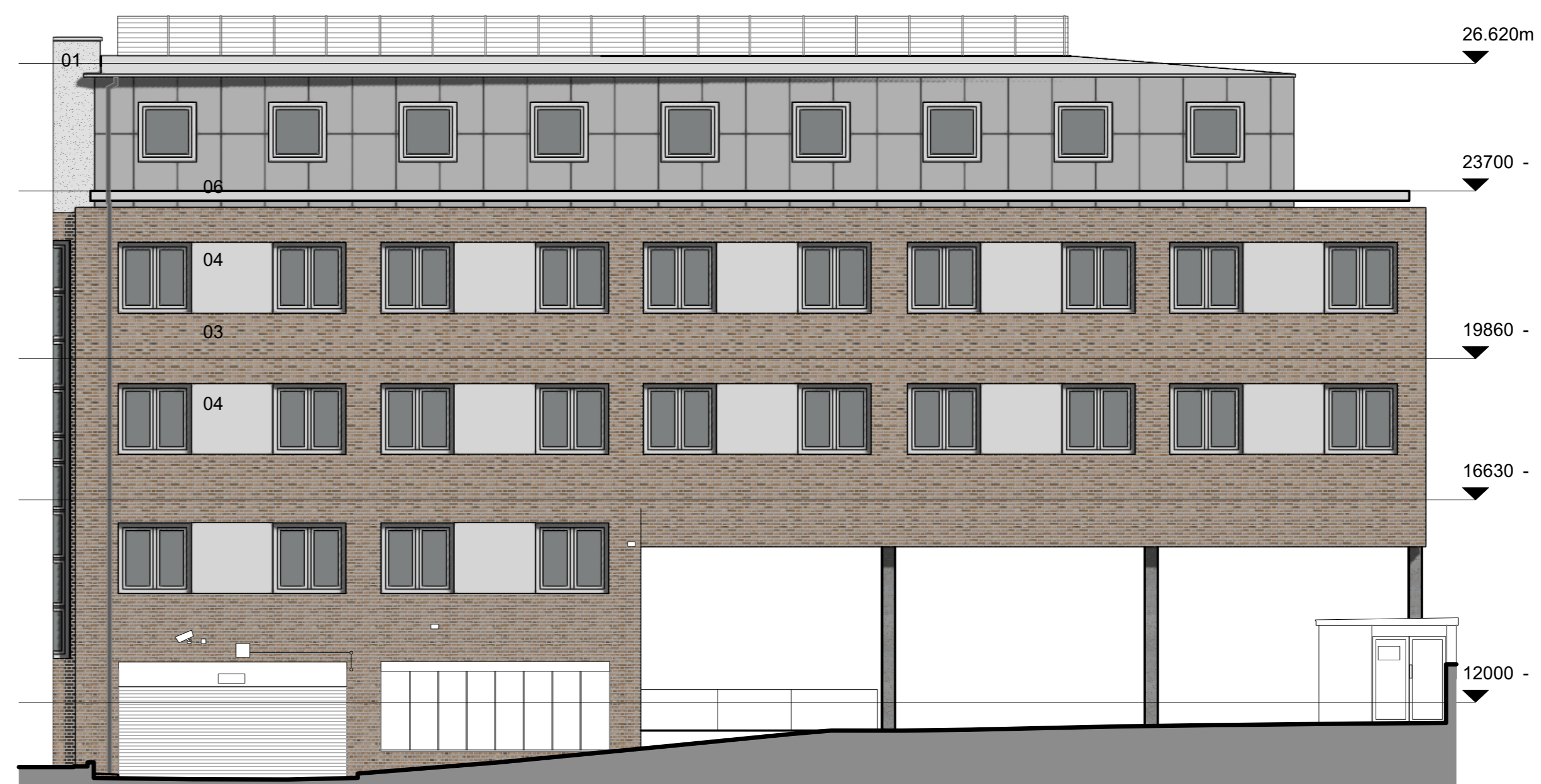
4 NORTH WEST ELEVATION 2 Scale: 1:100