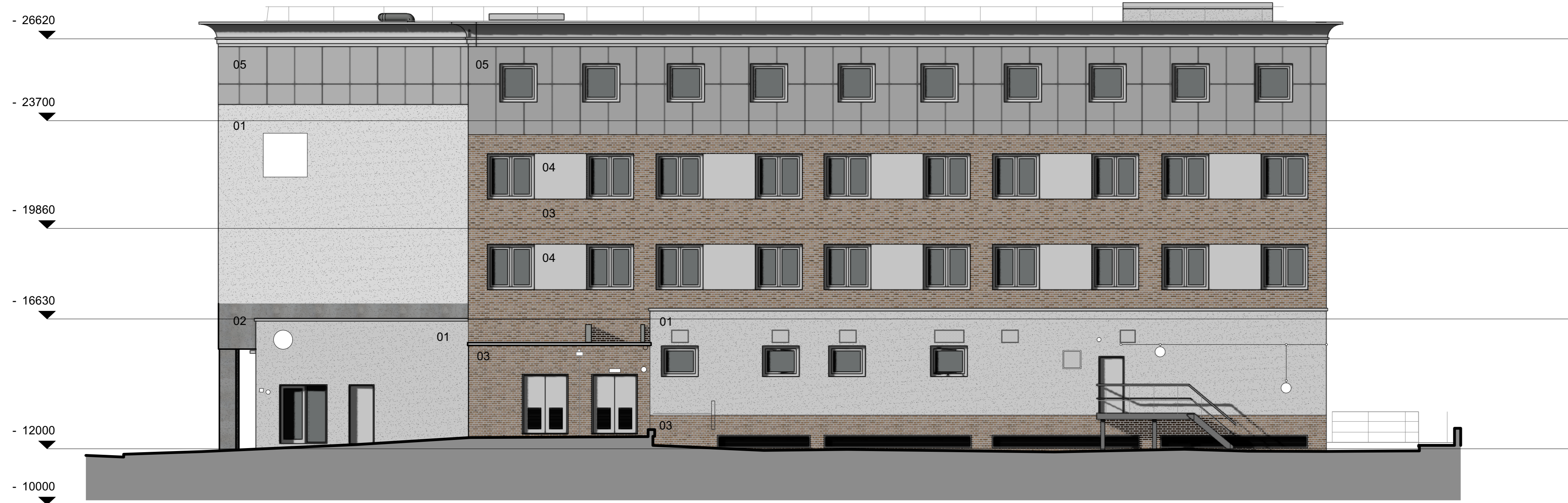
2 NORTH EAST ELEVATION Scale: 1:100