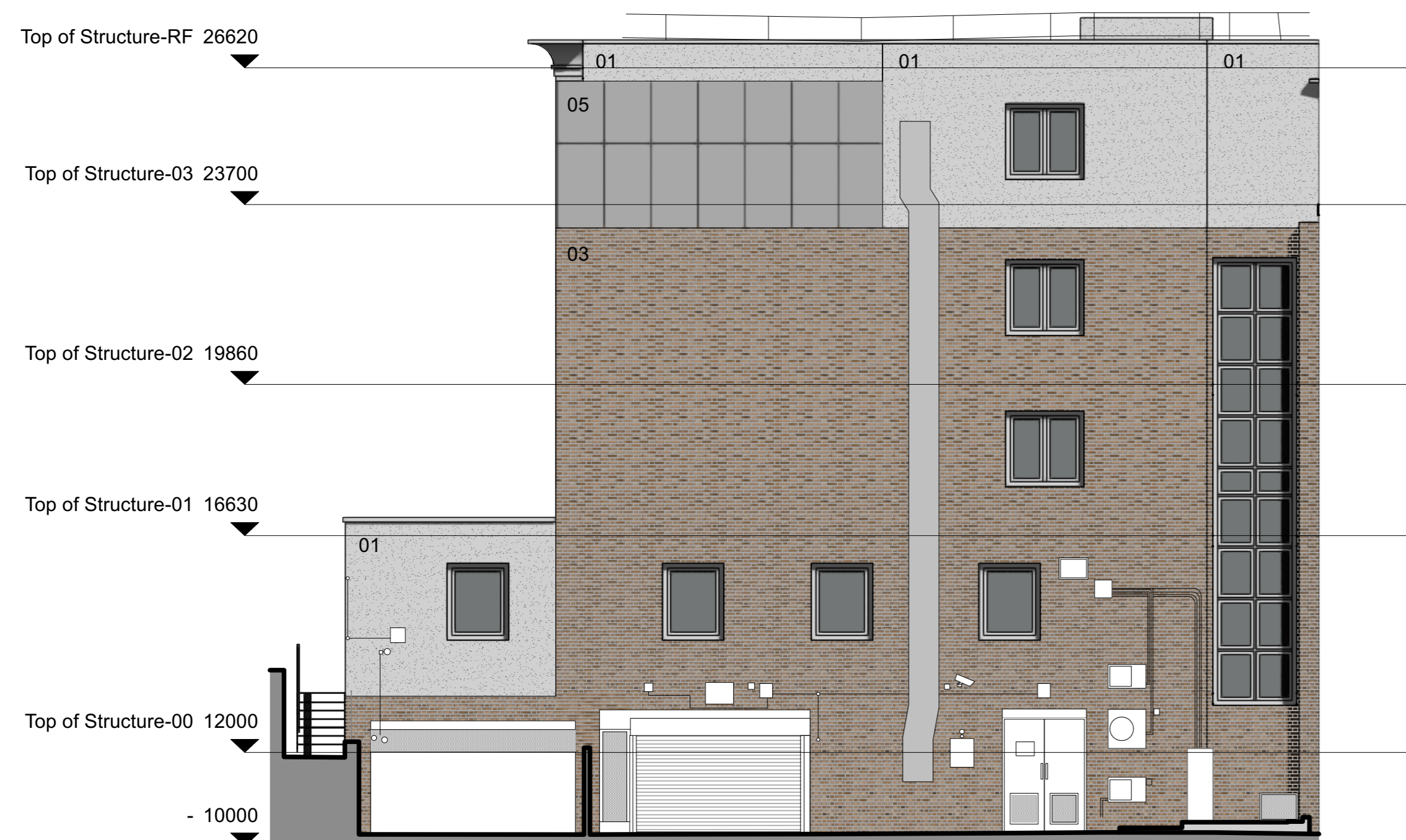
3 NORTH WEST ELEVATION 1 Scale: 1:100